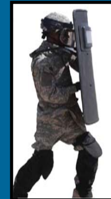
Ballistic-Non Ballistic Protection