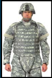
Interceptor Body Armor (IBA)