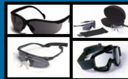
Military Combat Eye Protection (MCEP)