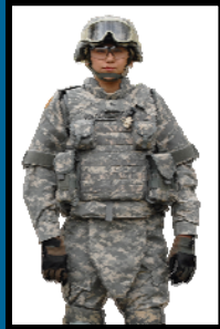
Improved Outer Tactical Vest (IOTV)