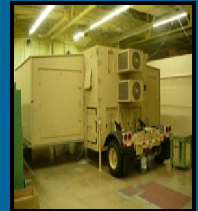
Non Destructive Test Equipment (NDTE)