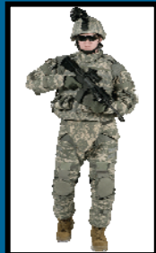
Improved Cupola Protective Ensemble (ICPE)