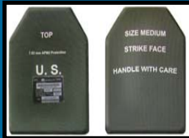
Enhanced Small Arms Protective Insert (E-SAPI)