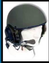
Combat Vehicle Crewman Helmet