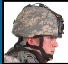
Advanced Combat Helmet (ACH)