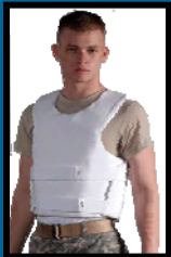
Concealable Body Armor (CBA)