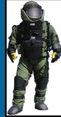
Advanced Bomb Suit (ABS)