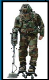
Body Armor Set Individual Countermine / BPFS (BASIC)