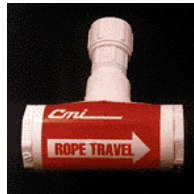
1 ea Washer, Rope