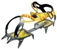
43 pr Crampon, Type I&II