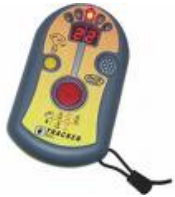
43 ea Transceiver, Avalanche