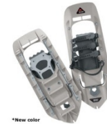
*New color 43 pr Snowshoe, Assault, Military