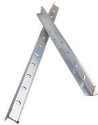
8 ea Anchor, Snow, Type I, Size I