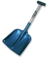
20 ea Avalanche Shovel