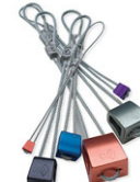
1 set Anchor, Rock, Type I