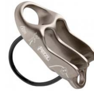
40 ea Belay Device, Mountaineering