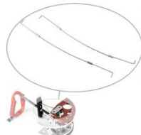
6 ea Trigger Repair Kits for SLCDs