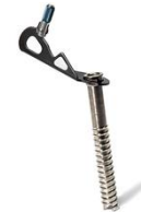
20 ea Anchor, Ice, Size II&III