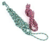
2 rls Rope Kernmantle, Type I, Size II