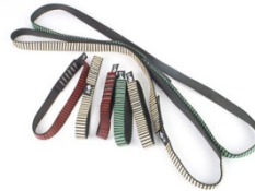
20 ea Webbing, Type I, Size III