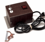
1 ea Rope, Cutter, Electric