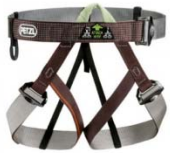
3 ea Harness, Mountaineering