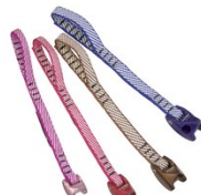
1 ea Set Anchor, Rock, Type III