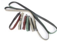
80 ea Webbing, Type I, Size III