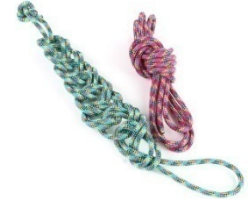
1 roll Rope Kernmantle, Type I, Size II