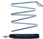
20 per PLT Probe, Avalanche