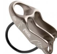
3 ea Belay Device, Mountaineering