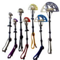
1 set Anchor, Rock, Camping Device