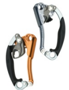
3 pr Ascender, Mechanical

Pictures are representative samples only and are not an endorsement of any brand or model