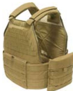
Scalable Plate Carrier