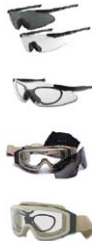
Military Eye Protection System