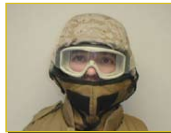
Headborne System Integration