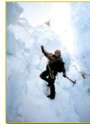
Marine Assault Climber's Kit

The Mountain Cold Weather and Support Equipment Team is responsible for providing timely, high quality Mountain Cold Weather equipment and Support equipment and to enhance the individual Marine's lethality and survivability.