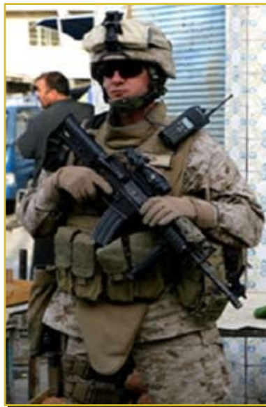
Modular Tactical Vest

The Armor & Load Bearing Team is responsible for providing individual ballistic protection and load bearing equipment to Marines.