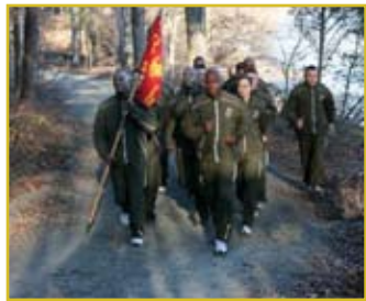
Marine Corps Running Suit