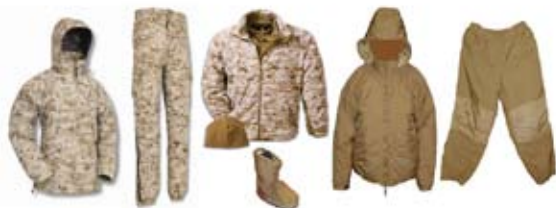
Cold Weather Layering System