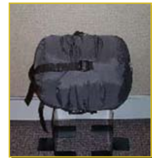
3 Season Sleep System (3S)