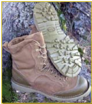
Rugged All Terrain Boot